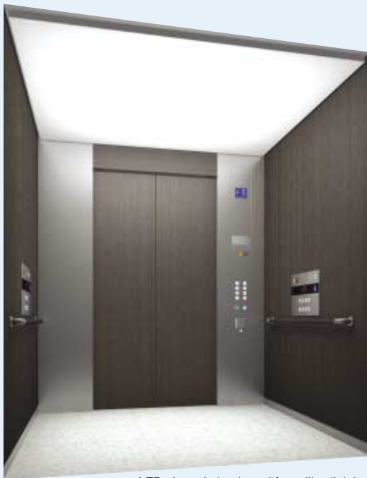
LED glass cloth adopted for ceiling lighting

Custom-order elevators retain the ease-of-use, comfort and sense of security inherent to the “XIOR” series. Customers can now choose according to their needs from a wider range of “XIOR” elevators, both standard and custom-order types.